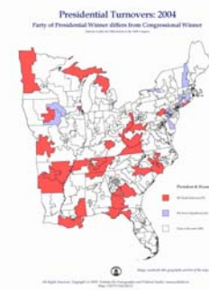
National Map: R