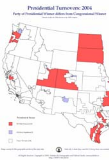
National Map: L