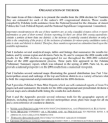
Org. of Book