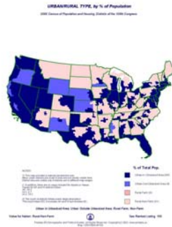
National CD Map