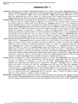
Area Profile-Sample Page