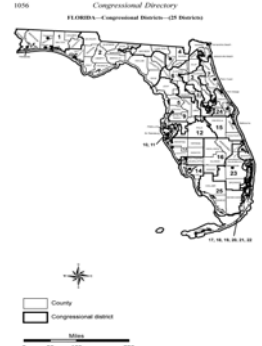
District Base Maps

Click on sample thumbnails above for adobe .pdf format. Color graphic pages will take longer to download than report samples.